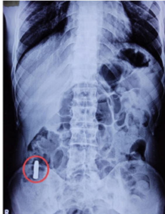
Figure 3. X-Ray showing the position of lodgement of bullet in the Ascending Colon.

No evidence of the bullet was found in the head and neck region, which indicated the formation of an orocutaneous fistula which was confirmed by computerised tomography (CT) scan suggestive of spontaneous swallowing of the bullet in the gastrointestinal tract. A well-defined hyperdensity showed streak artefacts i.e., a foreign body was noted in the abdomen in the right lumbar region, just posterior to the right