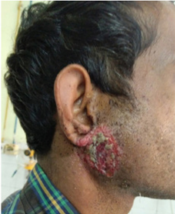
Figure 1. Entry point of wound.